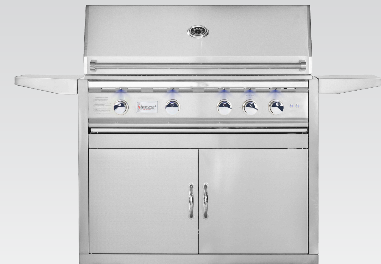
TRL 38" CART CART-TRL

Cooking Surface: 1,156 sq. in. Cutouts: (W) 38 1/2 x (H) 10 x (D) 20 3/4