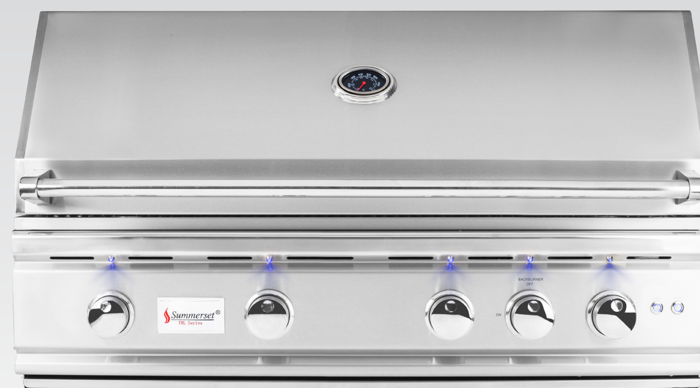
TRL 38" GRILL TRL38

Cooking Surface: 925 sq. in. Cutouts: (W) 30 1/2 x (H) 10 x (D) 20 3/4