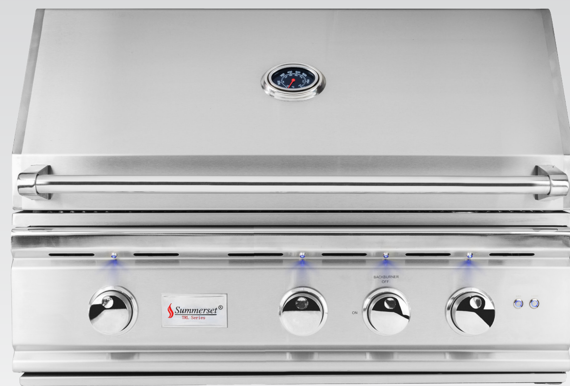
TRL 32" GRILL TRL32

The TRL is a fully loaded workhorse, a grilling classic packed with luxury features. Complete with interior lights, exterior LEDs, a rear infrared burner, full rotisserie set, flame thrower valves, easy clean briquette burner covers and plug-and-play infrared sear zone options, the TRL makes professional grilling easy. With a commercial-grade stainless steel construction and heavy-duty stainless steel burners backed by a lifetime warranty, this grill is built to last.