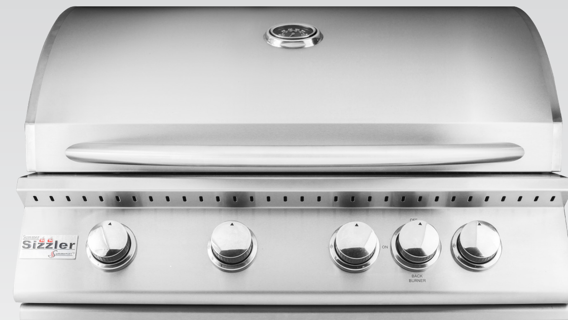
SIZZLER 32" GRILL SIZ32

Cooking Surface: 550 sq. in. Coutouts: (W) 23 3/4 x (H) 8 1/2 x (D) 20 3/4