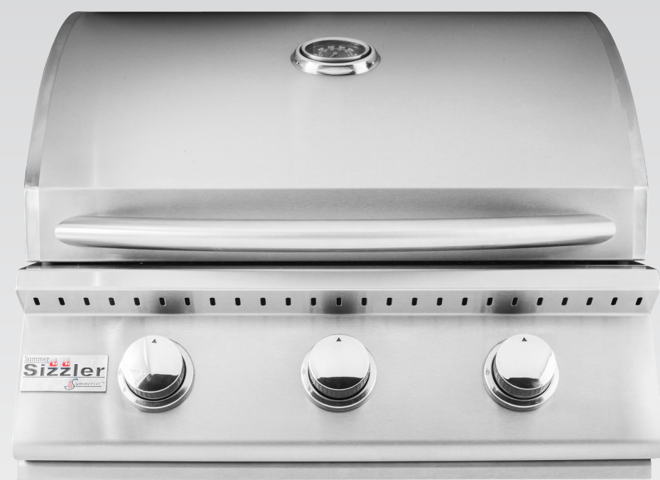
SIZZLER 26" GRILL SIZ26

Quality you can afford. The Sizzler Series is a premium product at an unbeatable price. Constructed in all #443 stainless steel* and designed with careful precision to ensure optimal airflow and even heating, this grill gives its higher—priced competitors a run for their money in both durability and grilling performance. The Sizzler will impress the most discriminating of grillers.