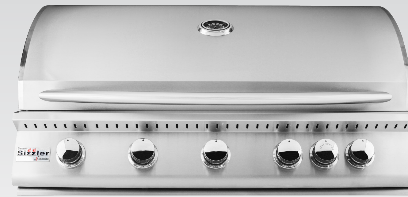
SIZZLER 40" GRILL SIZ40

Cooking Surface: 795 sq. in. Coutouts: (W) 30 5/8 x (H) 8 1/2 x (D) 20 3/4