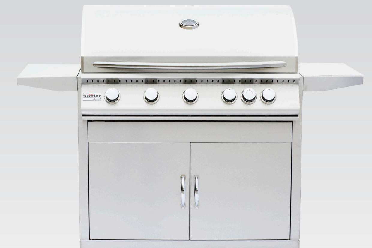
SIZZLER CART CART-SIZ

Cooking Surface: 985 sq. in. Coutouts: (W) 38 x (H) 8 1/2 x (D) 20 3/4