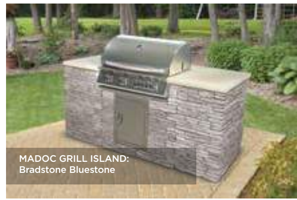
A MADOC GRILL ISLAND: Bradstone Bluestone

See larger color swatches in back of catalog.